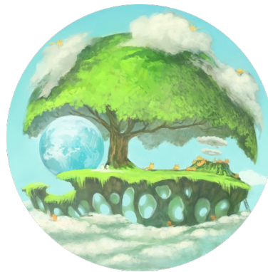
Snowcamp 2018 Framasoft